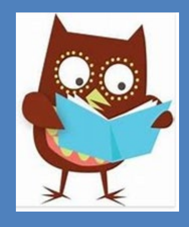
Oxford Owl Maths