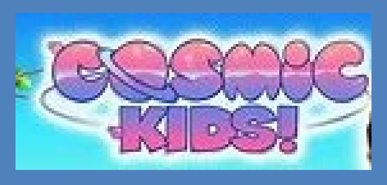
Cosmic kids yoga